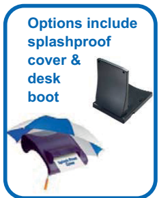
Options include splashproof cover & desk boot