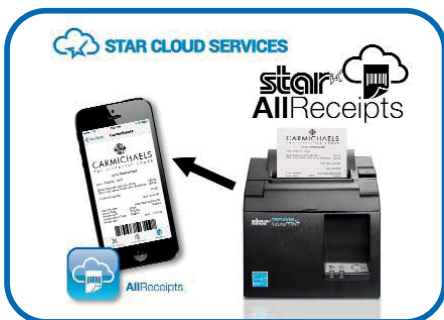
STAR CLOUD SERVICES star AllReceipts

No more curled receipts falling o the counter. Star's new "decurl" features literally attens the receipt before delivery.