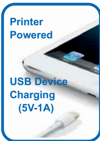
Printer Powered USB Device Charging (5V-1A)