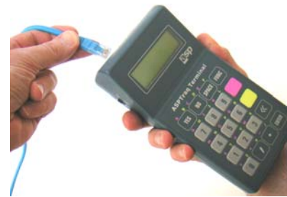
ASPTraq Ethernet Terminal

Perhaps not all your Terminals need to be portable. ASP's rugged low cost wired ASPTraq Ethernet Terminal is RFolution! compatible and can be intermixed with Portable RF Terminals. ASPTraq has a footprint of only 95mm x 190mm, a sealed keypad and LCD Display, and no dust attracting cooling fan. Combined with an ASP Barcode Scanner it makes a great tracking Terminal for industry.