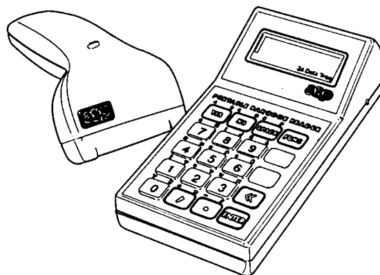
Z4 DataTraq with Barcode Zapper

And there's more! You get keys sized for real people, a clear LCD display, automatic barcode symbology discrimination, 32k, 128k or 512k of memory, an optional leather case, and a two year warranty.