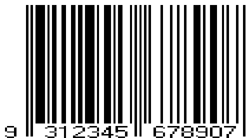
Ideal Wand Path (either direction)

Press the wand and scan the test barcode label on the right below, quickly and lightly. A successful scan will be indicated by an audible “beep” - if there is no beep, you must try again.